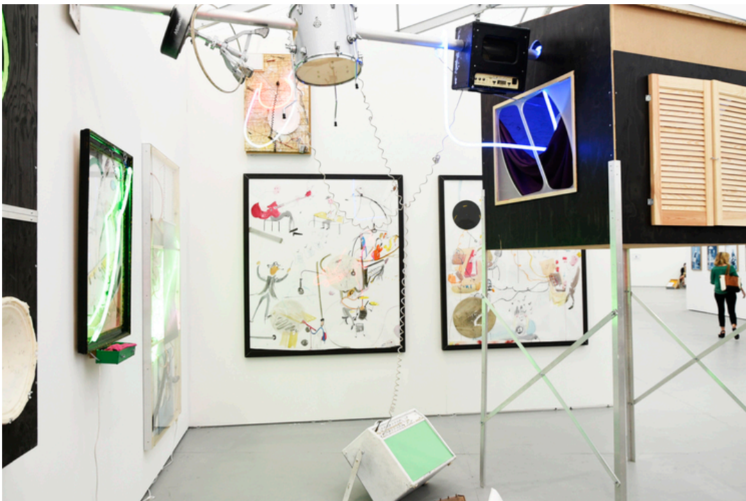
Installation view of Rotten Sun with Denis Gardarin Gallery at Untitled Miami 2015

MOORTELE: Well you have all those study years. The way of working is only a growing thing. When you grow up as a human being it's the same kind of thing I think. A major shift was around twenty, twenty-two when I started building installations. The first exhibitions were mainly installations, not really focused on sculptures or wall pieces or paintings. And then this took over again, by making sculptures again in to what I'm doing now. But it depends on museum shows and institutions. It's all part of the same thing but you show a different chapter of something.