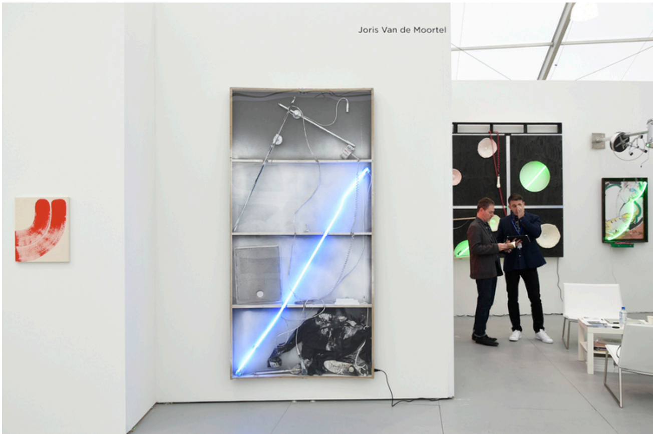
Installation view of Rotten Sun with Denis Gardarin Gallery at Untitled Miami 2015